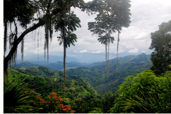
Rainforests and their importance