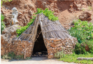
Stone Age, Bronze Age and the Iron Age