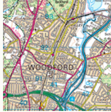
Fieldwork in the local area: Woodford